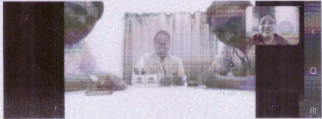
Screen Shot of meeting